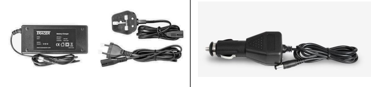
3A fast charger

The battery has inbuilt safety circuits. You must only the chargers supplied by TWL. The chargers below have a male barrel connection that connects to a lead that has a female barrel connector to male surface connector – see above.